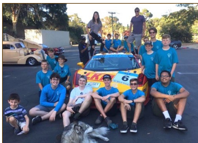
Troop 1602 sponsored a car show at the MV campus this summer, attracting classic rides and a great crowd.

Thank you for your continued support of Shepherd of the Hills UMC through your financial giving. Your support makes it possible for the work of God to encompass us so we can reach out and connect with Jesus and each other. At the Resource Team meeting, the budget for our fiscal year 2018-2020 was set for $1,211,100. We have received commitments thus far for a total of $652,720. If you have not turned in a Commitment Card or gone on-line to complete the form, please do so today.