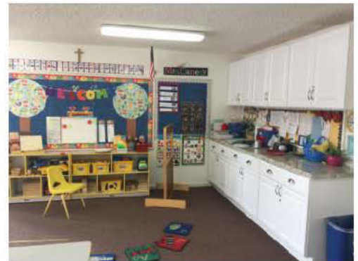
Our summer renovation included new cabinets for the preschool!